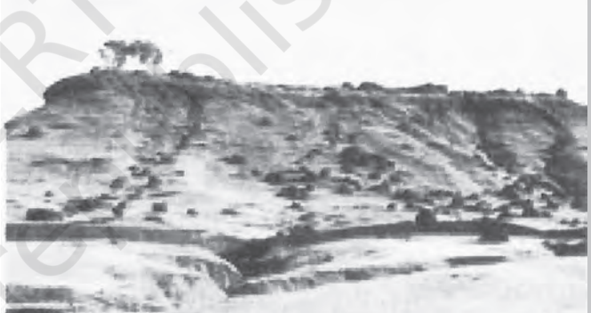
Ralegan Siddhi before mitigation approach

A Rs.22 lakh school building was constructed using only the resources of the village. No donations were taken. Money, if needed, was borrowed and paid back. The villagers took pride in this self-reliance. A new system of sharing labour grew out of this infusion of pride and