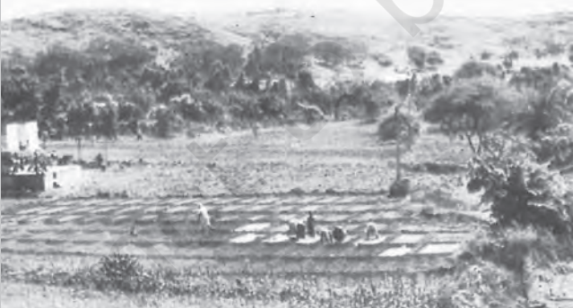
Ralegan Siddhi after mitigation approach

voluntary spirit. People volunteered to help each other in agricultural operation. Landless labourers also